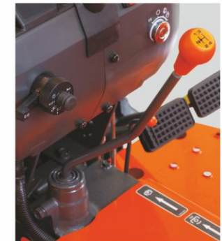
Main shift lever