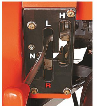
Range Shift lever

*Equipped with KRL 160D 3-point Kubota special linkage for KRL160D