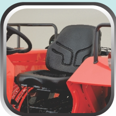
Larger Seat with Better Suspension, Comfortable & Adjustable for long Operating hours