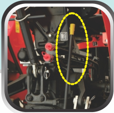
Accessible PTO Speed Change Lever