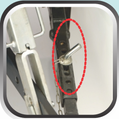
Telescopic Stabilizer for Easy Setting