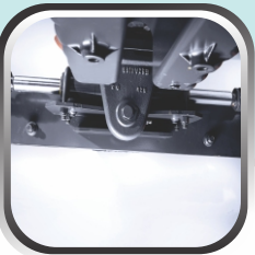
Double acting power steering with variable front axle