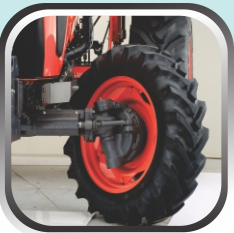
4WD Bevel Gear Technology