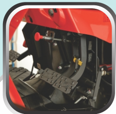
Suspended Pedal Improves Operator's Comfort