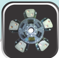
5 Fin Cerametallic Double clutch 25% more durability