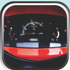
LED Back Light Meter Panel for easy operations even at night with all safety signs