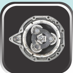
Planetary drive for better traction