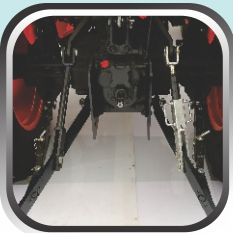
High Hydraulic Lift Capacity 1800Kgf & Extra hole provided for 2100Kgf