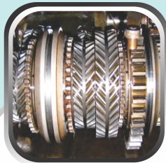
Main Transmission Synchromesh