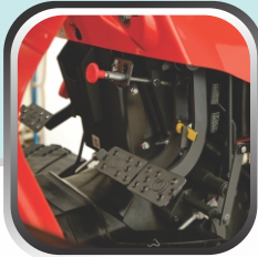
Best in Class Brake Lock