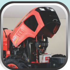
Front opening hood easy to open with the touch of a knob