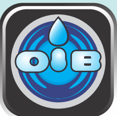
Reliable oil immersed brake