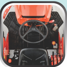
Flat Deck with Rubber Mat for Comfortable Operation