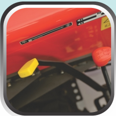
Independent PTO with STD ECO / RPTO*