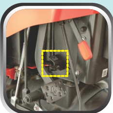
Clutch Fixing Lock for Better Clutch Reliability